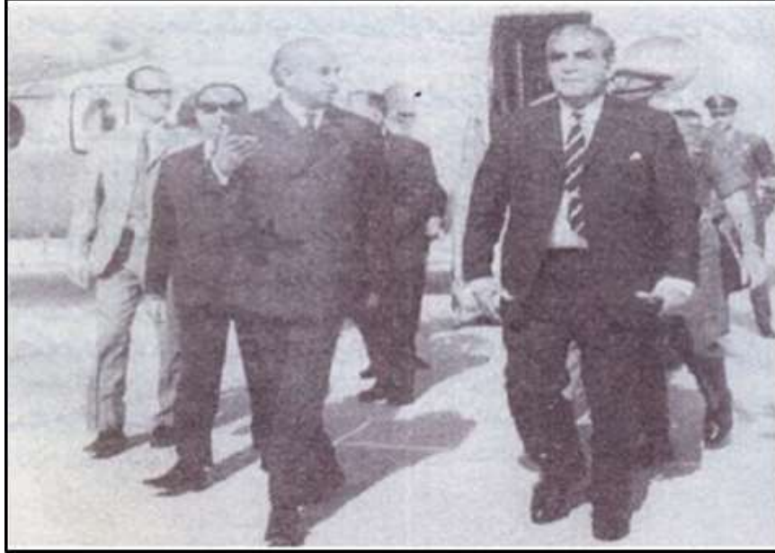
Bhutto and General Yahya Khan, Jan 1971

The 1971 India-Pakistan war saw the execution of a comprehensive strategy, instead of hastily mounting a military campaign, as in the past.