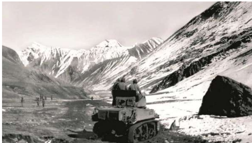
Stuart Tanks (7 Cavalry) in action at Zojila Pass

By 01 Jan 1948, United Nations (UN) gave a call for cessation of hostilities. By then, Indian forces had secured Srinagar and operations were progressing in the Jammu area towards Naushera and Rajauri. UN Security Council passed Resolution 47 on 21 Apr 1948, which was not accepted by Pakistan. In Jul 1948, UN Commission for India and Pakistan (UNCIP) visited both countries and on 13 Aug 1948 adopted a Resolution, which included a ceasefire, a truce agreement and consultations for a plebiscite, but again it was rejected by Pakistan.