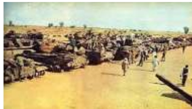
Abdul Hamid (4 Grenadiers) Graveyard of Pakistani Armour