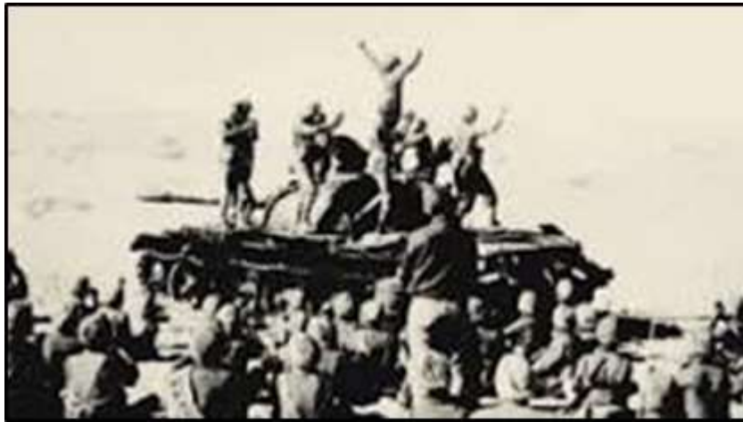
Victory at Longewala

The role of the IAF, both in gaining local air superiority and provision of ground support to the army was crucial. IAF actions in Chhamb-Jaurian sector (J&K) and at Longewala (Rajasthan) are worth highlighting.