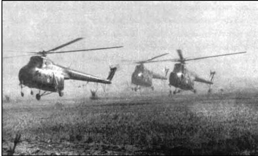
Mi 4 helicopters during landings in Sylhet Sector during India-Pak War 1971