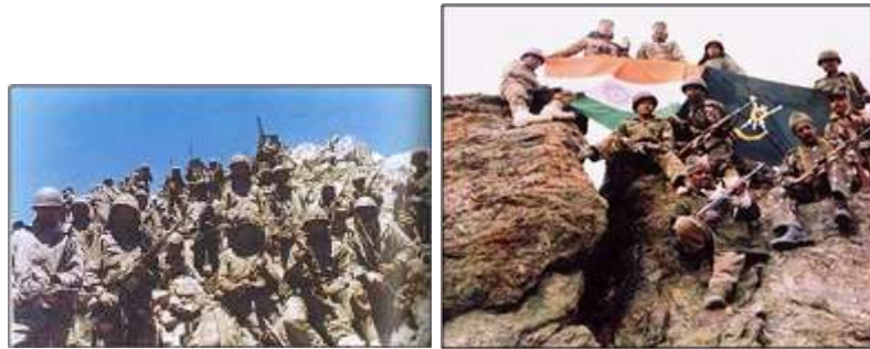
Victory at High Peaks in Batalik and Kargil

Commencing in Feb 1999, Pakistani troops from the elite Special Services Group (SSG) and the para-military Northern Light Infantry covertly set up bases on 132 vantage points across LoC, and surprised India. Once India mobilised, it regained control of the hills overlooking the highway and then commenced driving the invading force back across the LoC. The Battle of Tololing, amongst other assaults, slowly tilted the combat in India's favour. Some of the posts put up a stiff resistance, including Tiger Hill (Point 5140).