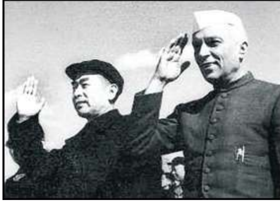
Jawaharlal Nehru with Chinese premier Zhou Enlai

On 08 Sep 1962, the Chinese crossed the Thagla Ridge in what was then North-East Frontier Agency (NEFA) and is now Arunachal Pradesh. Mired in old beliefs, Nehru announced that he had directed the army to "throw the Chinese out of Thagla" but had fixed no time limit. The age of innocence for India ended on 20 Oct when both in NEFA and Ladakh, the Chinese struck in strength and overran inadequate, and in many cases isolated Indian defences. Having achieved their immediate objectives, they halted their offensive five days later. So terribly shattered was national morale that the then President S. Radhakishnan accused his government of "credulity and negligence". Nehru himself told Parliament ruefully: "We were getting out of touch with the reality of modern world and were living in an artificial atmosphere of our own creation". The main advisors who had led Nehru up the garden path were then Defence Minister VK Krishna Menon; Director Intelligence Bureau BN Mullik; Army Chief General PN Thapar; and the ambitious military-bureaucrat Lieutenant General BM Kaul.