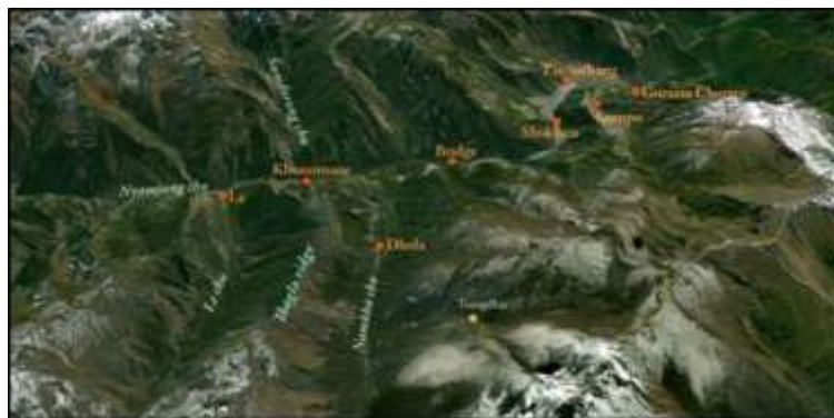
Annotated aerial photograph of Dhola Ridge and surrounding areas where the 1962 war started

India fought a month-long border war against China in 1962. Neither nation deployed air or naval resources during the war that was fought in the high mountains of the Himalayas. China ended the war by declaring a unilateral ceasefire and withdrew their forces to the pre-war positions.