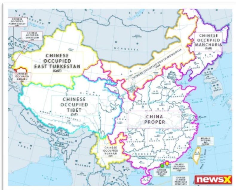
Map 1: Imperial Edict of Abdication of the Qing Emperor