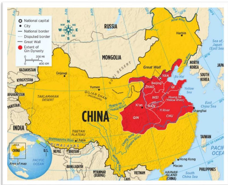
Map 2: China during Warring States Era (in Red)

and depth. Much like Russia, majority population and industry of China is limited to a small area out of a vast landmass. Namely, the successor region of the Warring States Era. 16 Annexation plays not only an important role in the economy but also creates other opportunities. For example, the deserts of Xinjiang Province serve as a weapon-testing site. 17