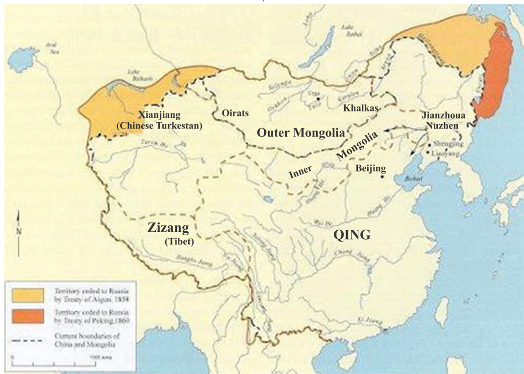
Map Showing areas ceded to Russia by China through the treaties of Aigun (Yellow shaded) and Peking (Orange Shaded) 10

Towards the end of 19 th century, Russia expanded into Manchuria. In 1900, Russia consolidated its presence as part of collective European intervention and built a naval base at Port Arthur (Lushun) and founded the city of Harbin 11 in Manchuria. Subsequently, Soviets became involved in the Chinese civil war, sided with the Chinese communist party, whilst giving arms to Chang Kai Shek's Nationalist party and even providing them with air support against the Japanese. Eventually, it supported the communist party led by Mao Zedong in the civil war.